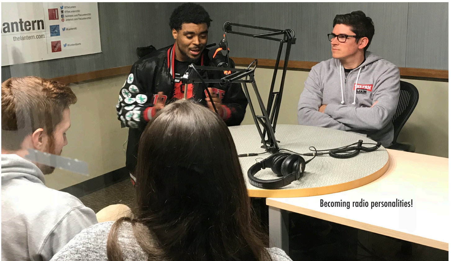
Becoming radio personalities!

Reading your Gentle Reminder is required and items in there may be included on weekly assessments.