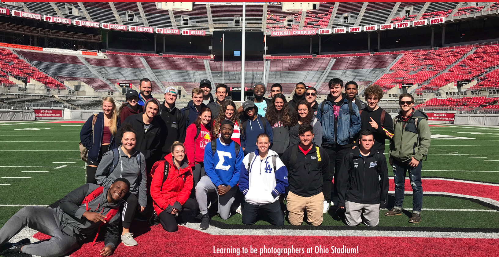
Learning to be photographers at Ohio Stadium!

Required: Watch a local sports newscast and ESPN SportsCenter a couple of times a week at least and try to listen to some sports talk radio.