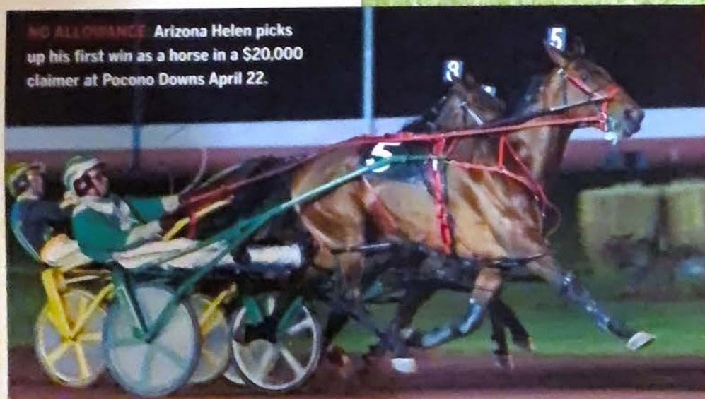
NO ALLOWANCE Arizona Helen picks up his first win as a horse in a $20,000 claimer at Pocono Downs April 22.